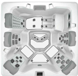
A7L Non-slip Aquatic Surface Layout