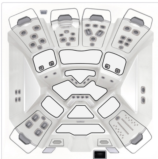
M7 Non-slip Aquatic Surface Layout