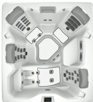
A6L Non-slip Aquatic Surface Layout