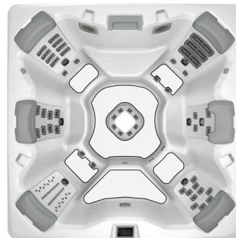
A8 Non-slip Aquatic Surface Layout