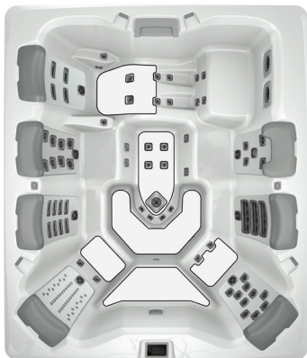
A9L Non-slip Aquatic Surface Layout