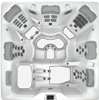
A8L Non-slip Aquatic Surface Layout