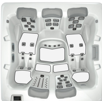
A7D Non-slip Aquatic Surface Layout