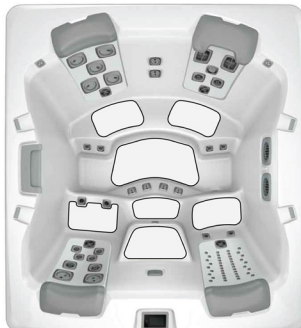
A6 Non-slip Aquatic Surface Layout