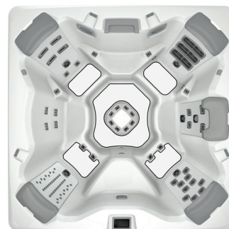
A7 Non-slip Aquatic Surface Layout